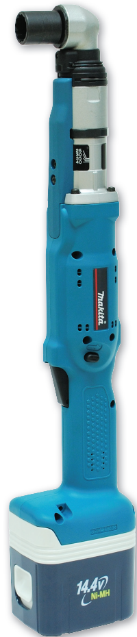
Electric Torque Wrench Learning System (95-PAS3)