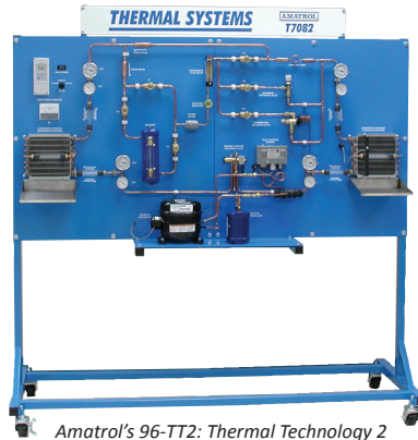
Amatrol's 96-TT2: Thermal Technology 2