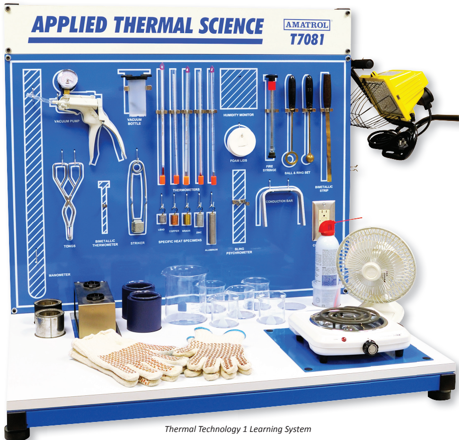
Thermal Technology 1 Learning System